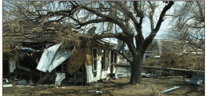
Grand Lake, LA where the eye passed

He lost a metal roof off a 30'x50' shop and had even more water damage to sheetrock and flooring. He has incredible footage of both storms and their damage.