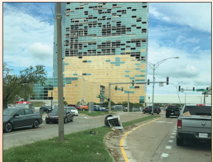
Capital One building, Lake Charles, LA, damage from Laura

"2020 can't end soon enough," Stephen summed up. We couldn't agree more.